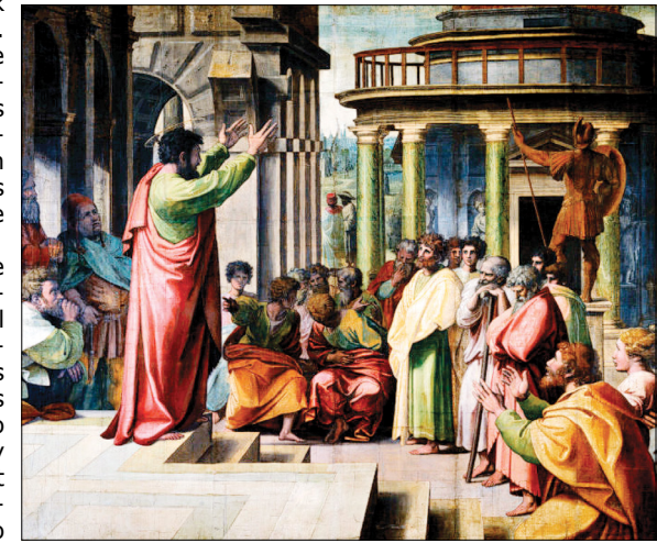
St Paul in Athens delivering the Areopagus sermon in which he addressed early issues in Christology, depicted in a 1515 portrait by Raphael

Paul set the scene for his proclamation by acknowledging the religious spirit of his listeners, illustrated by the many shrines to local or national deities; but he hit on the shrine that had been erected to the "Unknown God". Cleverly, he then unpacked his message about the God of the Hebrews and the Christians. Paul revealed God to be Creator, Sustainer and Judge. When he spoke of the Incarnation of Christ, and the Resurrection of Jesus, the scoffing began again. Some of his audience called him a "Babbling"!